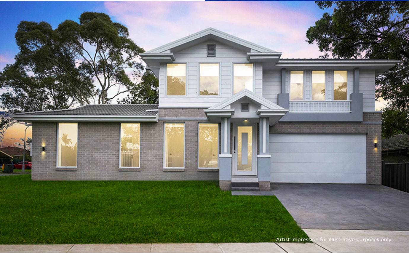
Artist impression for illustrative purposes only