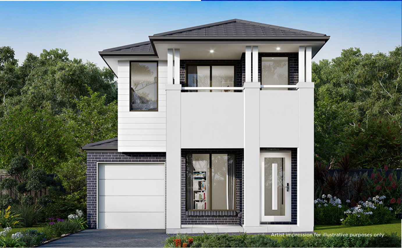
Artist impression for illustrative purposes only