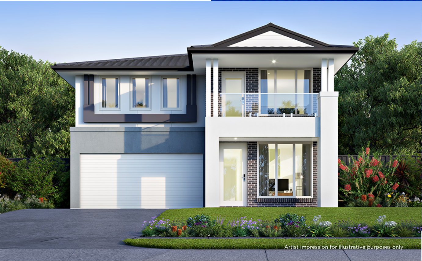
Artist impression for illustrative purposes only