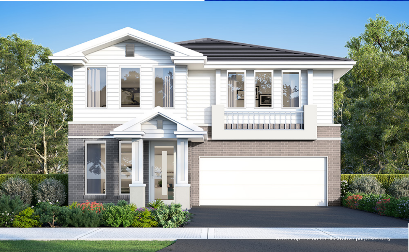
Artist impression for illustrative purposes only