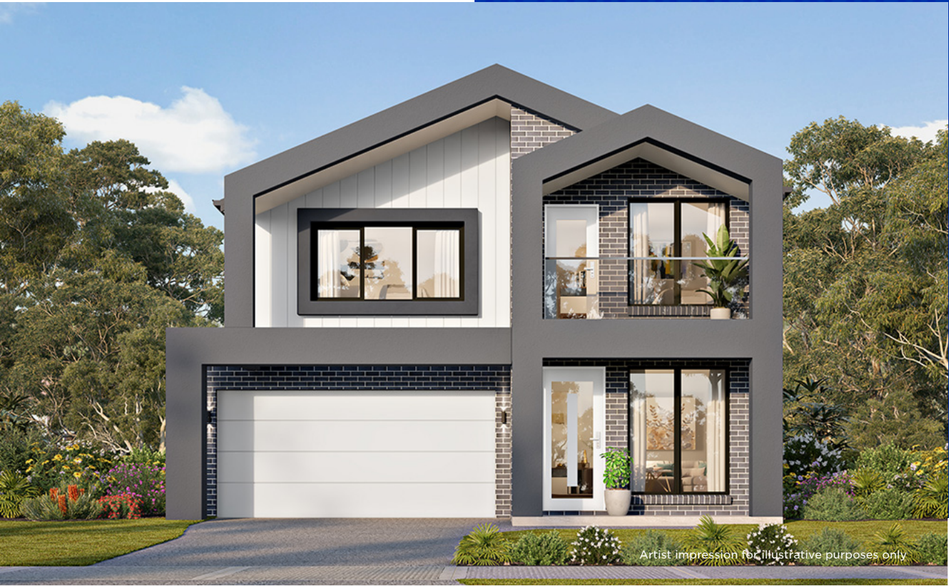
Artist impression for illustrative purposes only