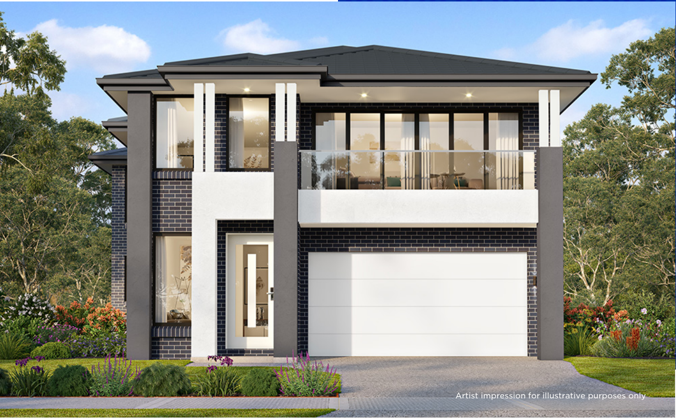
Artist impression for illustrative purposes only