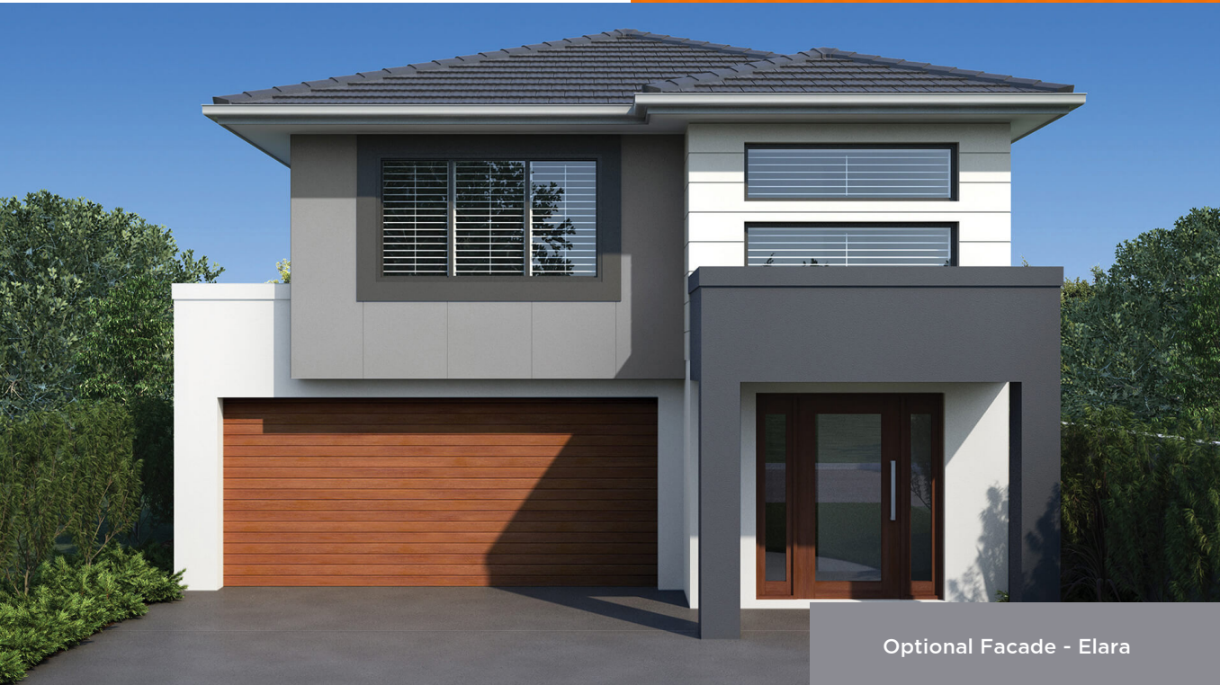
Optional Facade - Elara