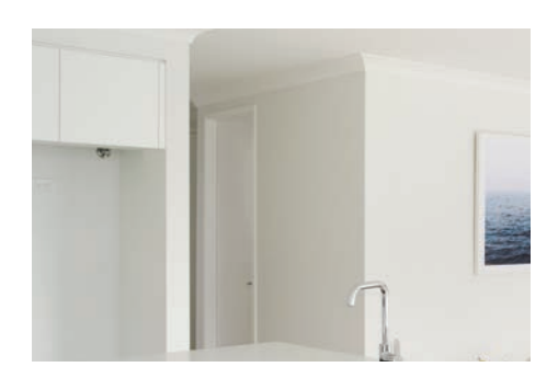
8. GROUND FLOOR DOOR HEIGHT Upgrade ground floor internal flush painted door height to a high 2340mm (h).