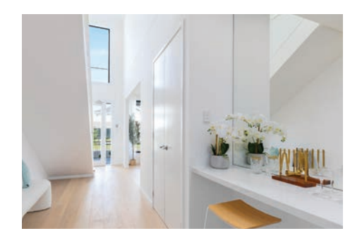
9. ROBE DOOR HEIGHT Upgrade ground floor robe flush painted door height to a high 2340mm (h).